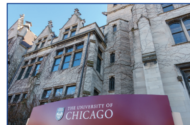
The University of Chicago.

Some devices can assist in various aspects of surgery—but all require proper education and expertise for appropriate indications, handling, and direction.