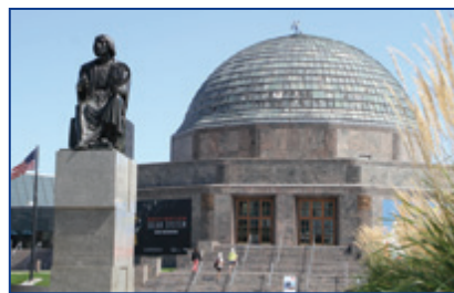
Adler Planetarium.