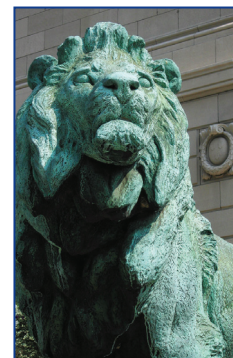
Bronze Lion outside the Art Institute of Chicago.