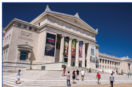
The Field Museum of Natural History.