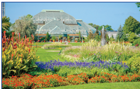
Lincoln Park Conservatory.

Similar to the operations of many of Chicago's public landmarks, there are literally hundreds of ISHRS member volunteers working in committees who along with our management team help build & maintain our Society. I extend my sincere thanks to each and every one for their generous time commitment and hard work.