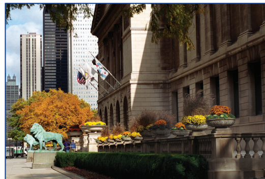
Art Institute of Chicago.