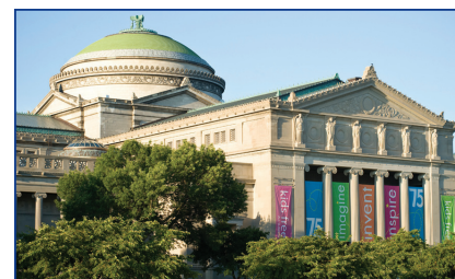
Museum of Science and Industry.