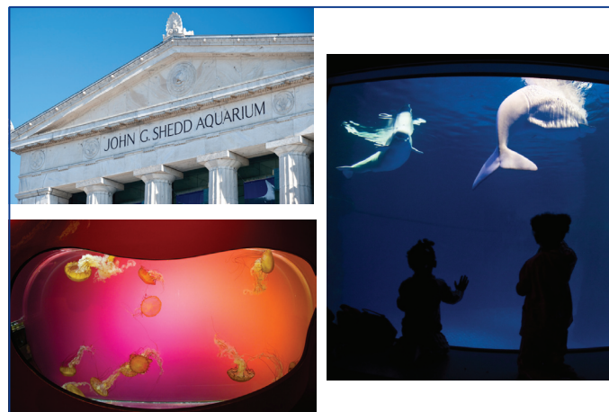
Shedd Aquarium—Beluga whale and Jellyfish exhibits.

Our consumer alert used these standards to inform and help guide patients expectations for which medical responsibilities