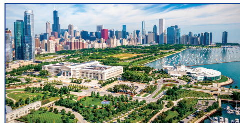
Skyline of Chicago.