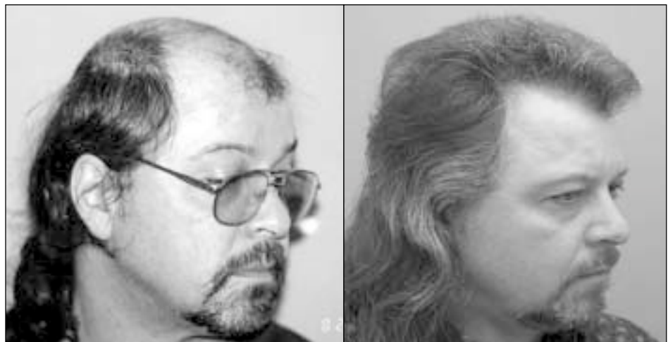
Figure 1. Pre-op and 8 months post-op side view of patient in mid-40s with 5,825 follicular.

As Figure 2 shows, perpendicular slits are cut perpendicular to the direction of hair flow with the blade handle slanted to match the existing hair angle. With this technique, the slits "sandwich" the grafted hair shaft to consistently maintain a much more acute angle during the healing process. The closer grafted hair matches existing hair the better it blends and thus the less detectable it becomes. The angulations and the resulting "shingling" effect will also provide improved coverage.