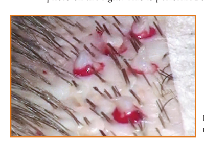
Figure 2. Properly dissected grafts will usually elevate slightly.