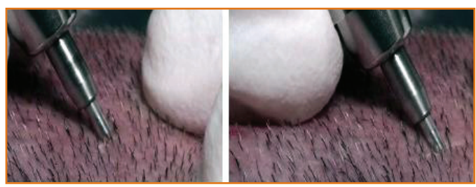
Figure 1. The subtle depression of the skin during punch "engagement" is seen in the photo on the right. This is performed before advancing the punch.

Editorial note: The pearls described in this column are obviously applicable to the particular instrument the author developed and utilizes, and other powered follicular unit extraction instruments may have subtle but significant differences in their use. With the goal of keeping our members abreast of all developments in FUE instrumentation, the Editors take this opportunity to welcome users of different powered or manual FUE instruments to submit their personal experiences to share with our readers, as Dr. Harris does in this How I Do It section.