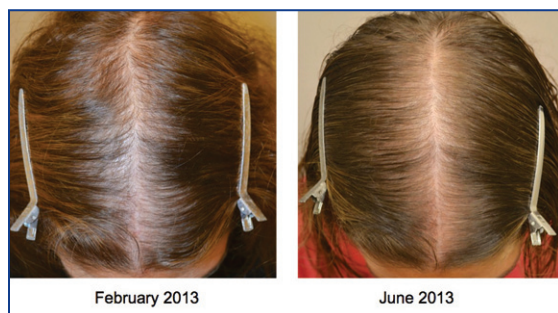
Figure 5. Before (left) and after (right) combination treatment with 5% minoxidil, oral spironolactone, and oral finasteride for 3 months.

therapies (Figure 5). Successful treatment of young women can be especially satisfying because we are improving their sense of confidence for a lifetime ahead.