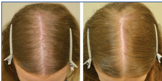
Figure 3. Before (left) and after (right) oral spironolactone 100mg/day for 6 months.

Spironolactone is a diuretic with anti-androgen properties. It can be helpful to explain to women that they have both estrogens (girl hormones) and androgens (boy hormones), and that in most women with FPHL these levels are NORMAL. 7 However, their follicles are genetically more sensitive to circulating levels of androgens, specifically in the frontal 1/3-2/3 of the scalp (or on the sides). Thus, spironolactone helps to block these androgen receptors and can help prevent the miniaturization process on the follicle. 8,9 Figure 3 shows an excellent response to 100mg/day over a 6-month period. The patient was an otherwise healthy 19-year-old female with a strong family history of thinning (father balded in his 20s). The patient was also advised to use topical minoxidil but admitted to using it only intermittently (once weekly).