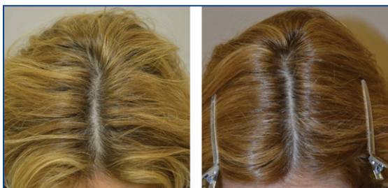
Figure 4. Before (left) and after (right) oral finasteride 5mg/day for 6 months.

(and you don't want to interfere with their drug regimen). The physician should explain that it is metabolized by the liver but that there are no real drug interactions. It should only be offered to women who are not able to or are planning to conceive in the near future. These women should have undergone a hysterectomy, had their tubes tied, or be on 1-2 forms of long-term and reliable birth control. They must stop the drug IMMEDIATELY if they get pregnant. They also should not donate blood while they are taking the drug.