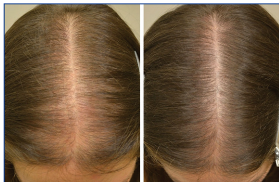
Figure 1. Before (left) and after (right) use of topical 5% minoxidil for 6 months.

Perhaps the most difficult thing about getting women to use topical minoxidil is helping them to understand that it works . They often believe that because it is over the counter, it can't possibly work. Or, they believe that if they stop it, ALL of their hair will fall out. Or that they have to use it forever. OR ELSE! These misconceptions can be addressed by drawing a simple diagram for your patients, using an x-y axis to demonstrate the natural progression of hair loss over time (Figure 2). By drawing a