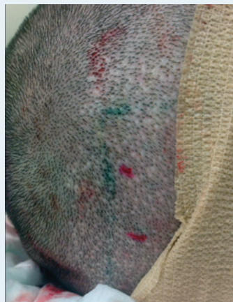
FIGURE 1. View of the donor area. The biopsies were taken adjacent to the red dots, where an obvious FUE wound was evident.

Here, we detail our observations of the histological appearance of removed tissue that included two of the “dots” in a patient who had undergone a prior FUE procedure.