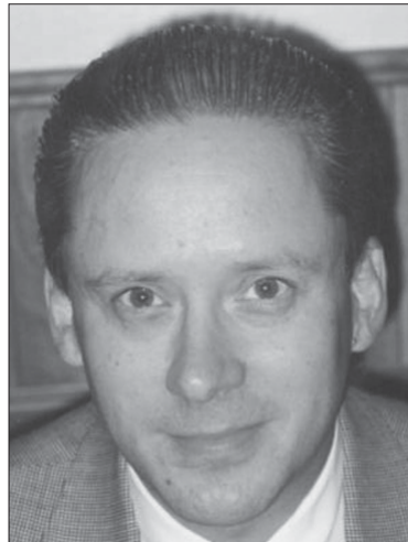
Figure 4. Front view of same patient as in Figure 3.