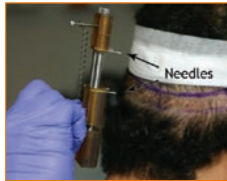
Figure 4. Intraoperative use of laxometer

We have started to use the laxometer routinely on almost all patients; however, we continued to seek a method to decrease human error in measuring the laxity. Thus, we equipped the laxometer with a spring to provide a constant pulling force instead of the surgeon's hand pulling the pads. The two pads were attached to the skin with fixed needles (Figure 4) to eliminate slipping of the pads on scalp skin. Obviously, this method should be performed after applying