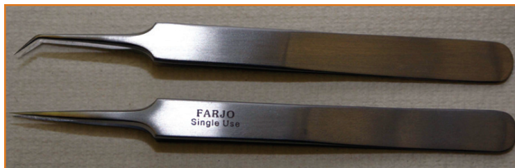
Figure 1. The Farjo single-use placing forceps

After liaising with Robbins Instruments at the present time, the standard of the jewelers forceps is acceptable, although they are not as fine as the Ellis stainless steel forceps (Figure 1). This has led us to modify the size of incisions of our single-haired grafts. Normally we would use a 22g needle in-