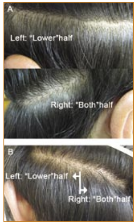
Figure 2. Photographs from two representative subjects that showed notable differences between "Lower" and "Both." A: "Lower" half shows Type C and "Both" half shows Type A-2; B: "Lower" half shows Type A-2 and "Both" half shows Type S.

were pointed out. First, approximately 10% of the Visible Scar type for the "Lower" and "Both" groups had a donor strip width of 1.0cm or less, whereas this type was not seen in groups with a maximum strip width of 1.0-1.5cm. Second, the Visible Scar type comprised 0% (0/5) for "Both" as opposed to 40% (2/5) for "Lower" when the maximum strip width was more than 1.5cm. Third, regardless of the maximum excision width, the resultant donor wound was more attractive for "Both" than for "Lower" in all except for cases in which both halves were equal. Figure 2 shows examples in which the difference between each half is easily visible.