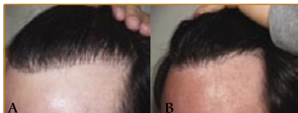
Figure 3. Case 3