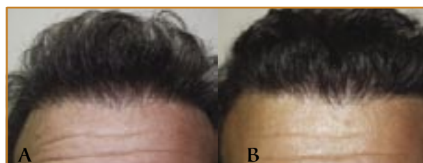
Figure 4. Case 4