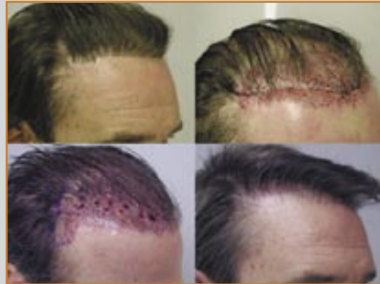
An example of a patient in whom a pluggy hairline was treated with linear excision and recycled grafts immediately planted into forelock and hairline. No separate donor harvest was performed. Eight months later additional intense 4mm plugs were removed with 3.5mm punches, and additional hairline grafting was performed using recycled hair and primary donor harvest. Final result is seen 18 months following the first procedure.

proper applications of these techniques...." The fact is that many pluggy hairlines or hairline position problems require repair with surgical procedures that require significant surgical training and experience. Paradoxically, more invasive procedures often result in softer, more natural results than the less aggressive grafting procedures that created the unnatural appearance.