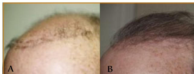
Figure 1. Case 1