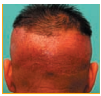
Photo 5. Status post-FUE with occlusive ointment. An occlusive dressing could also be used

reduces scarring. Full dressings would not encourage or speed wound healing of the modern hair transplant patient (although they were used with plug-type hair transplant surgeries). Unfortunately, the hair in the area prevents occlusion via conventional means (e.g., an occlusive dressing); therefore, an occlusive ointment is best (Photo 5).