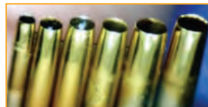
Figure 4. TiN coated punch.

TiN Coated Punch: This is a punch whose tip is coated with titanium nitride (TiN) so that the punch has a characteristic gold colored tip. This improves the lifespan of a sharp punch.