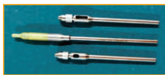
Figure 2. Versi handle and CIT manual punch handle.

Handle: The tool by which the punch is held, carried, and depth controlled. There are some different handles for the manual FUE technique, the most popular are the Versi handle and the CIT manual punch handle.