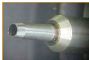
Figure 10. Dull punch.

Donor Area Template: This is a template that allows the margins of the presumed safe donor zone and extraction zones to be marked.