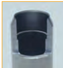
Figure 3. Cannula punch.

Cannula Punch: This is a cylindrical punch usually made of stainless steel.