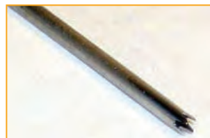
Figure 5. Serrated punch.

Serrated Punch or Wave Punch: This is a punch with a serrated cutting edge that offers many small points of contact with the skin. It can also be called a triple wave punch (Rassman).