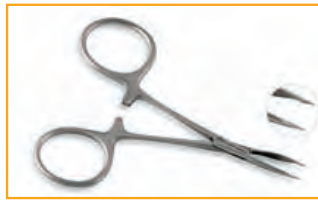
Figure 1. Aide to Extraction (ATOE).

the time when the punch incises the grafts using a single step or multiple step process and the time when the grafts are physically removed from the donor area. Following the delay in extraction, the grafts may be placed in a holding solution or reinserted into the scalp immediately.