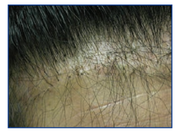
Figure 9. Post-transplant kinkiness, compression, pitting, ridging