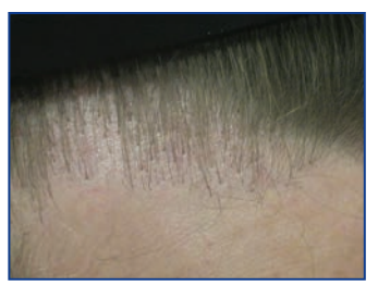
Figure 8. Pitting, compression

Grafts forced into incisions too narrow also can cause popping leading to RPT. A scalp surface abnormality called ridging, the formation of an elevated ridge, can occur sec-