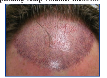
Figure 3. Scalp incisions, 2,800

The second myth is that punches are preferable to inci-