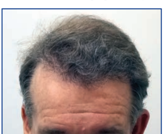
Figure 16. 6 months after 1,600 strip grafts