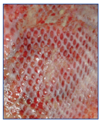
Figure 4. Meshed split-thickness skin graft

sions since they remove bald scalp. Punches do remove bald scalp if there are no existing follicles in the recipient area, but the graft replacing the bald skin removed is 98% bald itself. If you calculate the surface area of a 1mm-diameter graft and subtract the surface area covered by three hairs of average hair shaft diameter, you will find the remaining uncovered, bald surface