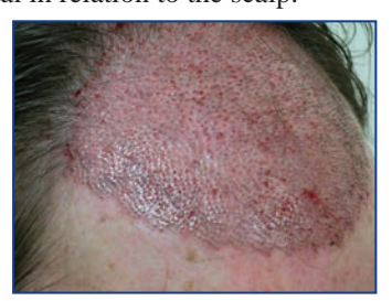
Figure 6. Immediate post-op

The epidermis of the graft remains approximately 1/2 millimeter above the epidermis of the scalp, thus acting as an important marker to avoid placing the top of the graft below the skin preventing ugly pitting or a depression in the scalp surface (Figure 6). If the grafts are placed too deeply, after healing, a deep pit can form that blocks the reflection of light creating an unsightly black hole (Figure 7) More subtly, it can look like the well or crater around the base of a tree after the snow melts around the tree trunk (Figure 8). This elevated epidermis