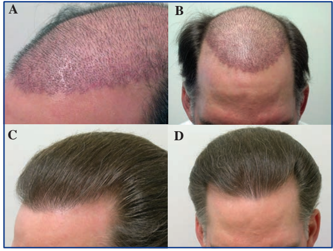
Figure 1. A: (top left) 12 days post-op: 3,000 grafts; B: (top right) 12 days post-op: 3,000 grafts; C: (bottom left) 1 year post-op: 3,000 grafts; D: (bottom right) 1 year post-op:

Over the years that I have performed hair transplant surgery, I've noticed a wide range in the quality of graft placement. I've observed physicians who take the utmost care in removing and preserving follicles only to hand them off to placers who leave them half hanging out of the scalp with little chance of survival. I've talked with physicians about differential graft placement (assessing every follicle in every graft and placing the graft in the scalp where it would have the greatest positive effect) asking them if their placers do this, only to be met with blank stares. While I have placed many grafts over the years, over the past four years, I began placing approxi-