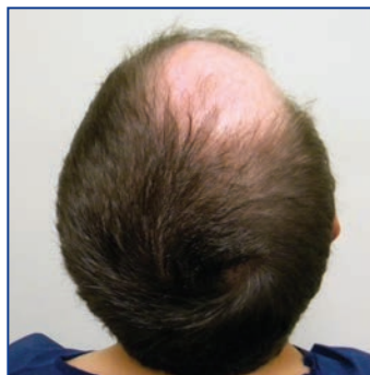
Figure 6. Affected area, posterior-superior view