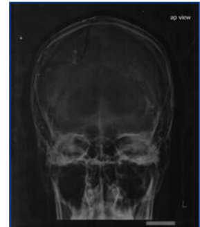
Figure 1. Pre-op X-ray, AP view

Scalp exam reveals a large area of hair loss (Figures 3-6). The skin over the area is normal, but with no remaining pores or vellus hairs. Upon questioning, the patient states that during the radiation treatments the skin in this area became red and irritated, with a few small ulcers that healed completely after the series of treatments was finished. His hair never grew back in these areas. He has no hyperesthesia in this area, and feels the skin is slightly numb. Palpation of the skin in this area reveals good capillary refill and no soft spots. The hardware from the craniotomy is neither visible nor palpable through the skin. There is also a visible vertical temporoparietal scar on the right side,