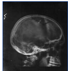
Figure 2. Pre-op X-ray, lateral view