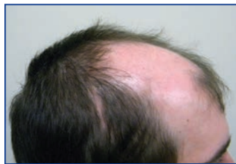
Figure 5. Affected area, right lateral view