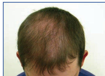
Figure 10. 1 year post-op, top view