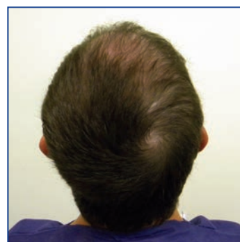
Figure 12. 1-year post-op, posterior-superior view