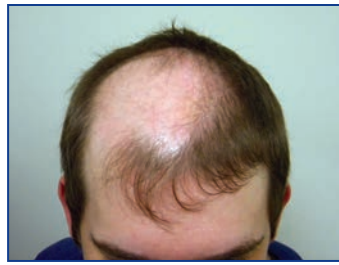
Figure 3. Affected area, frontal view