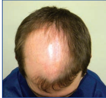
Figure 4. Affected area, top view