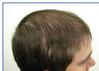
Figure 11. 1 year post-op, right lateral view