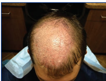
Figure 8. Immediate post-op, grafts in place