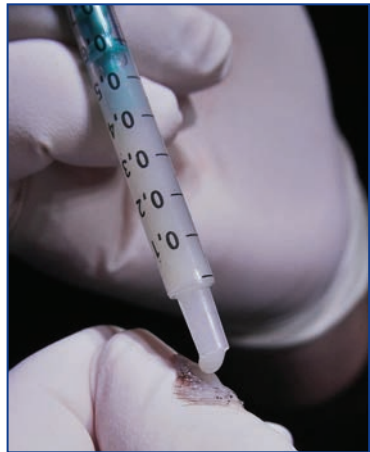
Figure 8. A drop of super-concentrated ACell suspension is placed on a pile of grafts prior to placement.