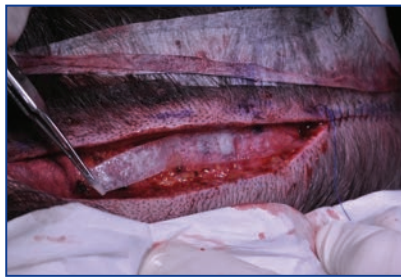
Figure 7. During donor closure, thin strips of ACell sheet are placed deep in the wound bed and the skin is sutured over it.

Some will question whether all of this is really necessary. I can merely state that these bio-enhancements have helped me improve my results. It is up to each individual surgeon to identify possible areas for improvement in their own results and to make a plan to address these. I'm reminded of the debates in the mid-1990s about whether microscopic dissection was really necessary. Many of us thought this was unnecessary at the time, but individual and collective experience over the years confirmed the superiority of the follicular unit approach. Time will tell whether these bio-enhancements are accepted in the same way. What happens will be determined by our shared clinical experience.