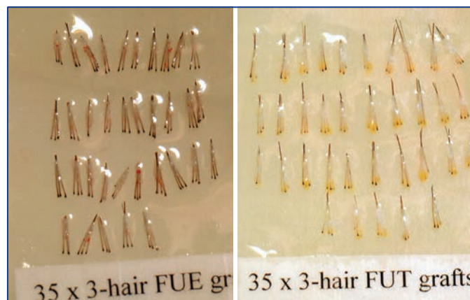
Figure 1. 3-hair FUs used in the described study.