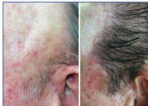
Figure 3. Before (left) and after (right) transplantation with grafts stored for 5 days in HypoThermosol/ATP; over 70% growth was documented by counting hairs, which had been dyed black.

The patient was followed periodically and final hair counts and photos were done at 18 months. Graft survival per area was: A) 72%, B) 44%, and C) 0%. HypoThermosol with liposomal ATP was the clear winner (Figure 3). While this study was only of a single patient, it is the longest survival study of hair ever reported (to my knowledge). And it does suggest that there would be some benefit even during shorter storage times (e.g., 2-6 hours) of a standard hair transplant.