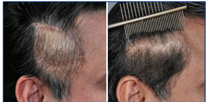
Figure 5. This patient had a skin cancer that was removed and repaired with a graft. A hair transplant at another clinic was not very successful. We transplanted 1,353 FU grafts coated with ACell MatriStem. There is excellent growth and an improvement in the underlying skin texture.

Using ACell-coated grafts helps protect and rejuvenate the recipient bed as well. I have been impressed with ability of ACell to reverse scarring and improve vascularity in scalps that have "old work" (plugs, mini-grafts, etc.) (Figure 5). I believe there is better protection for surrounding pre-existing hair (Figure 6) and that increase vascularity will lead to better growth in future procedures. Dr. David Seager pioneered the "one pass" density result because he believed micro-fibrosis would hinder growth when transplanting into the same area a second time. I believe this is less of a concern when ACell is used.