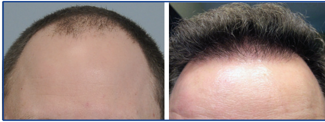
Figure 4. Before (left) and 7.5 months (right) after FUE procedure in which grafts were stored in HypoThermosol/ATP, showing excellent growth.

if necessary, store grafts in a standard refrigerator overnight so they can be placed the next day.