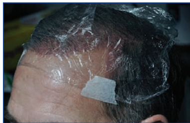
Figure 2. For several days post-operatively, we have our patients wear Saran Wrap over their grafts. This is taped to the forehead and lifted up periodically so the grafts can be sprayed with liposomal ATP.

How we use ATP: the liposomal ATP (available from Energy Delivery Solutions) comes as a concentrated solution that needs to be diluted for clinical usage. As a holding solution additive, we add 1cc concentrated ATP to 100cc of HypoThermosol FRS. For the post-op spray, we add 10cc ATP to 90cc of saline in a spray bottle we give to the patient. We have them spray every 1-2 hours for the first 48 hours (including waking up the first two nights), and then every 3-4 hours thereafter while awake. For the first couple of days, the patients keep their scalp covered with kitchen cellophane to keep the moisture in, similar to a greenhouse (Figure 2).