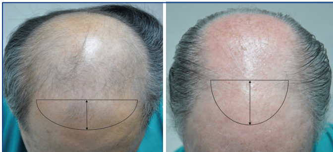
Figure 1. Comparative anatomy of typical Asian and Caucasian skulls (top view). The typical East Asian male has a round skull (left), while the average Caucasian male has an ovoid skull shape (right).

The most common cause of male pattern baldness (MPB) is androgenetic alopecia (AGA). 1 The clinical onset of baldness in both men and women generally occurs at around the age of 30 to 40 years old. 2 In Southeast and East Asia (SE and E Asia), the incidence of male pattern baldness varies depending on region, is generally lower compared to their Caucasian counterpart, but is also increasing with age. 3-10 Not surprisingly, more Orientals are seeking a permanent solution to their hair loss by means of hair transplantation. The creation of a natural hairline is possibly one of the most important steps of a successful hair transplant and reflects on the surgeon's aesthetic and artistic flare. Knowing the trend of hairline as it changes with age helps the surgeon to plan ahead and design a hairline that is most natural for the patient. To create a good hairline, understanding the anatomical differences between the Caucasian and Asian hairline is essential. East Asian men tend to have brachycephalic or round skulls, while Caucasians tend to have doliocephalic or ovoid skulls (Figure 1). East Asian scalps tend to be wider and flatter, with rounded frontotemporal angles, and most patients of East Asian origin seek a flatter hairline that mimics this nature. 11