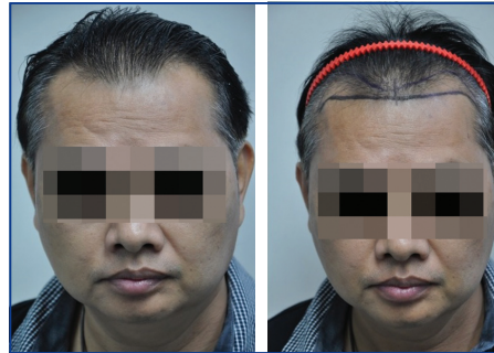
Figure 8. A straight hairline on a square face makes the face appear squarer.

Face shape also plays an important role in hairline design. For example, a straight hairline will make a square face appear broader (Figure 8), a high hairline will make an oblong face appear even longer (Figure 9), and a low hairline makes a round face look shorter (Figure 10). A V-shape hairline may look good on Caucasians, but it does not look natural on East Asians. 18