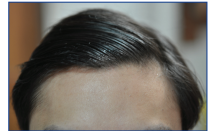
Figure 5. Upsloping hairline

In the study, we noted 55.5% of the hairlines were upsloping (Figure 5), 35.4% were straight (Figure 6), and only 9.1% were downsloping (Figure 7).