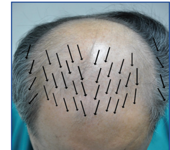
Figure 3. A conjugate "ridgeback" hairline, where there is convergence of the hairs towards the center.