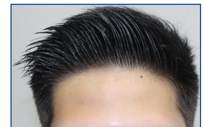
Figure 7. Downsloping (juvenile) hairline

The hair direction flowed from the left to right in 59.8% of the cases, flowed right to left in 15.8%, was radial in 10.5%, and was anterior flowing in 13.9%. The presence