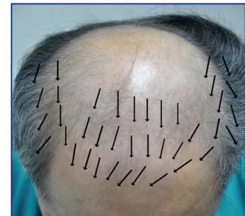
Figure 2. Left-to-right hair direction extending to mid-frontal section, with gradual conversion to straight anterior on right side.

There is limited literature on the characteristics of the naturally occurring hairline in Orientals. We studied the changes to the hairline with age in Chinese males and its common characteristics for better application to SE and E Asian patients seeking hair restoration surgery.