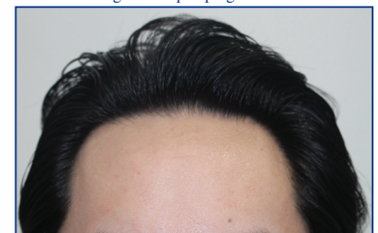
Figure 6. Straight hairline

The top three most common face shapes in Chinese based in Singapore were oval (46.9%), round (16.8%), and square (13.9%).