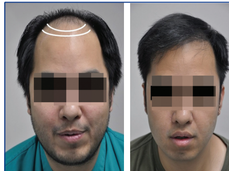
Figure 9. A high hairline makes an oblong face look longer.