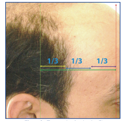
Figure 2. Temporal points/peaks (P)

P1 indicates the temporal point (apex of the peak) is located not less than the junction of one-third and two-thirds of the distance between