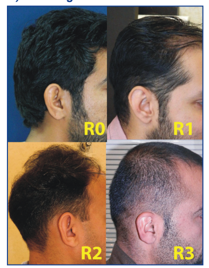
Figure 3. Reverse thinning (R)

R1 indicates mild reverse thinning; that is, the density is decreased considerably and is lim-