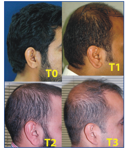
Figure 4. Overall thinning (T)

T3 indicates severe loss of density (more