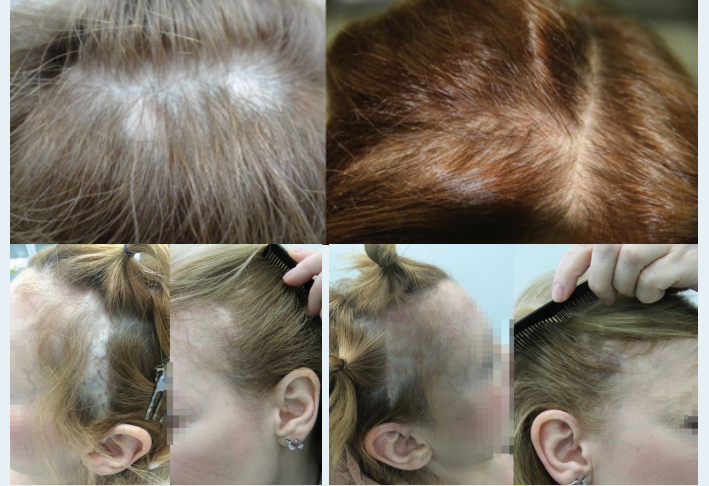
FIGURE 1. Scalp scars treated with fat and hair grafting.

opposed to the challenges of harvesting stem cells from bone marrow. 2 Stem cells have shown at least some efficacy for the treatment of pattern baldness. Second, the tissue possesses anti-androgen activity, androgens being an element in the progression of male pattern hair loss (MPHL) and possibly female pattern hair loss (FPHL). 3 Third, adipose tissue possesses anti-inflammatory properties. Inflammation is associated with, if not a contributing factor to, pattern baldness, with mild perifollicular fibrosis and infiltrates found in some patients with androgenetic alopecia. 4 Adipose-derived stem cells may prevent further inflammation and possible damage to hair follicles through enhancement of anti-oxidative and anti-inflammatory mechanisms. Fourth, as described above, adipose tissue induces neovascularization, and can potentially thicken the subcutaneous layer that typically is associated with thinning in androgenetic alopecia. 5